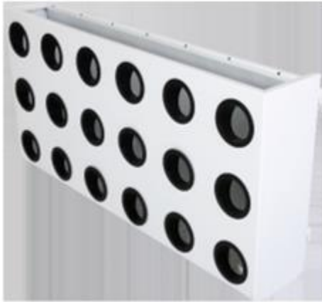
Vertical Planting Cassette