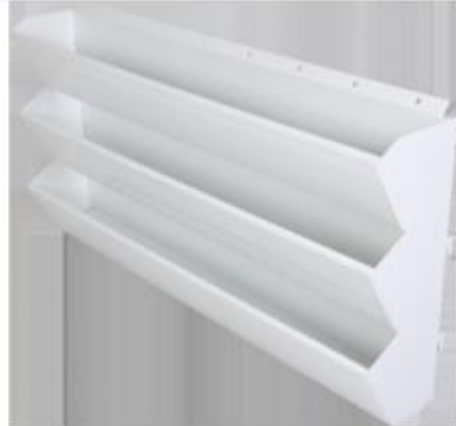
Stepped Planting Cassette