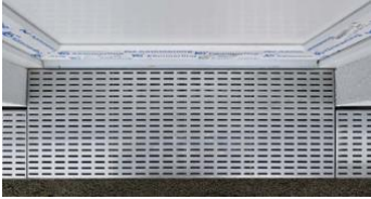
RichardBrink_StabileA ir_Friedrichsdorf_04 The gratings, also always custom made, guarantee a seamless cover at all times, including in the reveal areas.